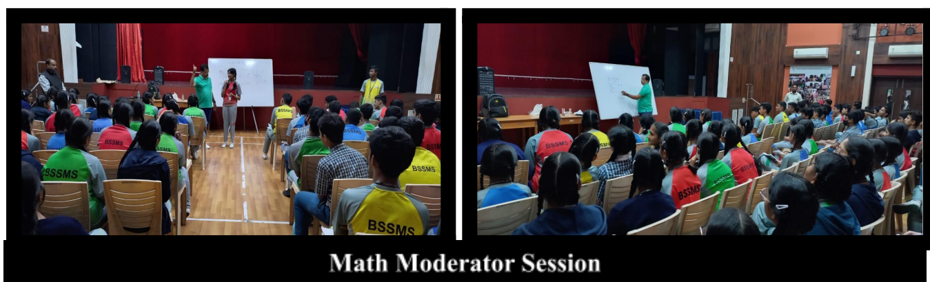
Math Moderator Session

the best marks and also how to avoid common mistakes that could cost them precious marks. Std. X also had the moderator sessions of Math, Sanskrit and Science. These sessions had helped the students to organize their paper in the best way.