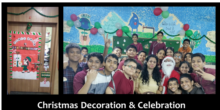
Christmas Decoration & Celebration

On 23rd December a Christmas Celebration was conducted for classes VI to X with a special assembly, carol singing with Santa, food and fun stalls and music. Students also had a class decoration activity prior to the celebration which was held on 21st December.