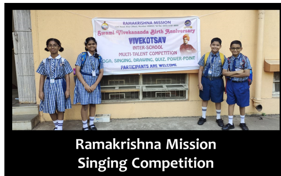
Ramakrishna Mission Singing Competition

Open Day was conducted on 17th December for all classes from VI - X. The students were handed over their report cards and weak performers were asked to work on their performance.