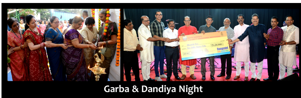
Garba & Dandiya Night

5th November saw a mega cultural event as part of the Care to Share initiative to support the Indian Armed Forces. The Garba & Dandiya Night was held on the school grounds and generated a record collection of 5 lakh rupees