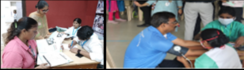
Health Check-up Camp by Fortis Hospital

The month of October was primarily concerned with the Term Examinations and Assessments and the awaited excitement of the Diwali celebrations.