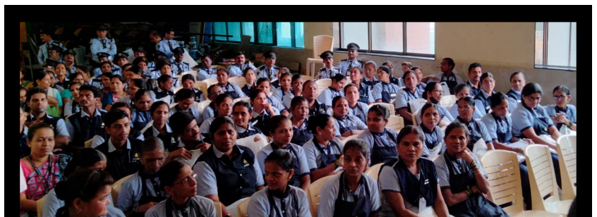
Joy of Giving

The SSR committee arranged a ' Joy of Giving ' initiative on 19th October wherein they provided the housekeeping security and support staff with shirts or sarees and cash along with some other goodies which were donated by the staff.