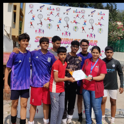
Inter School Athletics and Rink Football conducted by St. Arnold's High School

This month was eventful, revolving around learning, healthcare, well-being, generosity, service and festivities.