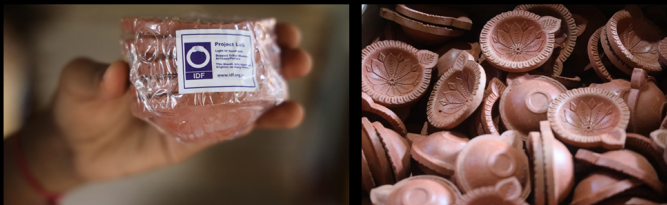
Sale of Diyas in aid of Tribal Women Artisans and Potters

IGKO external exam was conducted on 11th October while Std VI to VII began with their First Summative Assessment on 12th October and Std IX and X continued with their First Semester Examinations . IEO external exam was conducted on 14th October. UCO external exam was conducted on 19th October.